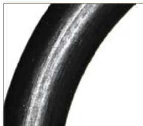
High temp. FFKM before