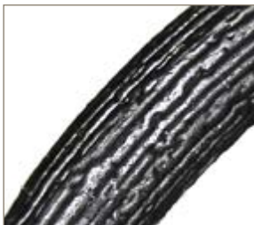
High temp. FFKM after