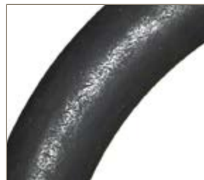
Competitor A before