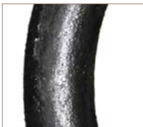
Competitor A after